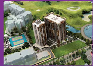
Gold Coast, Sector-2, Plot No. G.H-7, Near ABES Eng. College, NH-24, Dundahera, Ghaziabad, U.P.

— GOLF COURSE & LAKE FACING LUXURY APARTMENTS —